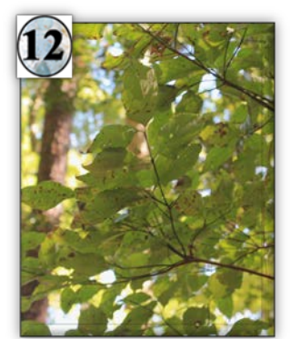
Tree Name: Dogwood Scientific Name: Cornus florida Fun Fact: The official Virginia state tree and flower. Avg. Height: 10m (32ft)