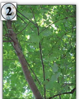
Tree Name: Red Maple Scientific Name: Acer rubrum Fun Fact: Symbol of Rhode Island and on Canadian Flag. Avg. Height: 15m (49ft)