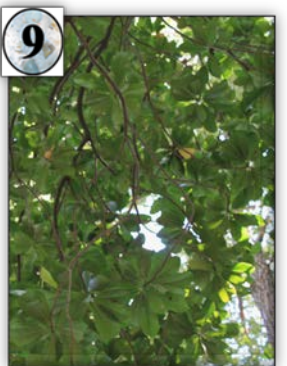
Tree Name: Magnolia Scientific Name: Magnolia grandiflora Fun Fact: Very large genus of about 210 flowering plant species. Avg. Height: 12-24m (40-80ft)