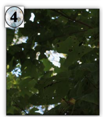
Tree Name: Tulip Poplar Scientific Name: Liriodendron tulipifera Fun Fact: Pioneers used them to make canoes. Avg. Height: 58m (190ft)