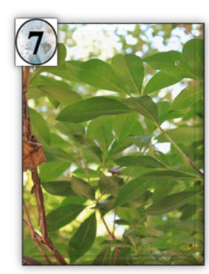
Tree Name: Mountain Laurel Scientific Name: Kalmia latifolia Fun Fact: Everything is poisonous; do not eat. Avg. Height: 3-9m (9-29ft)