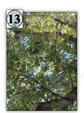
Tree Name: Red Oak Scientific Name: Quercus rubra Fun Fact: It can withstand pollution very well. Avg. Height: 28-43m (91-141ft)