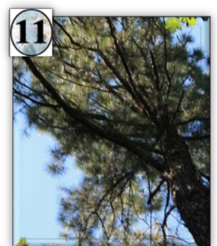
Tree Name: Loblolly Pine Scientific Name: Pinus taeda Fun Fact: One of the fastest growing trees. Avg. Height: 30-35m (98-114ft)