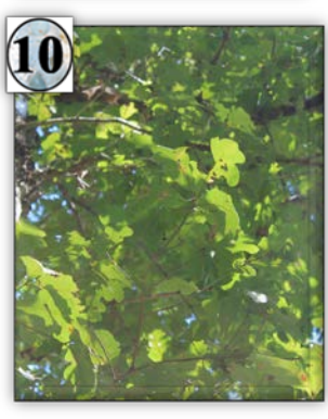
Tree Name: White Oak Scientific Name: Quercus alba Fun Fact: The wood is water resistant. Avg. Height: 20-26m (62-82ft)