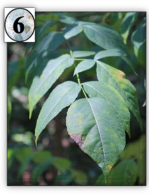
Tree Name: Devil's Walking Stick Scientific Name: Aralia spinosa Fun Fact: Thorns on stems and under leaves are used for protection. Avg. Height: 2-8m (6-26ft)