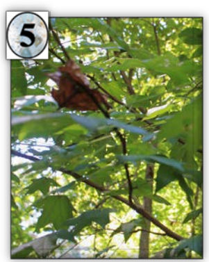
Tree Name: Sweet Gum Scientific Name: Liquidambar styraciflua Fun Fact: Lives up to 400 years. Avg. Height: 45m (150ft)