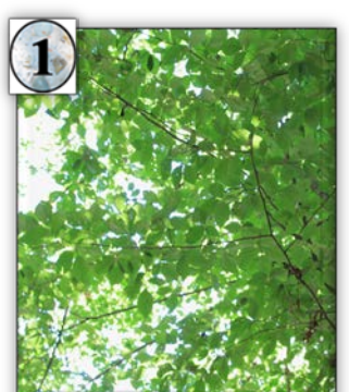
Tree Name: American Beech Scientific Name: Fagus grandifolia Fun Fact: Used to make Beech Nut Gum flavoring. Avg. Height: 20-35m (65-114ft)