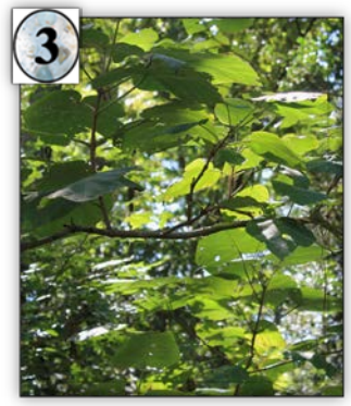
Tree Name: Catalpa Scientific Name: Catalpa speciosa Fun Fact: Wood used for guitars. Avg. Height: 12-18m (39-59ft)